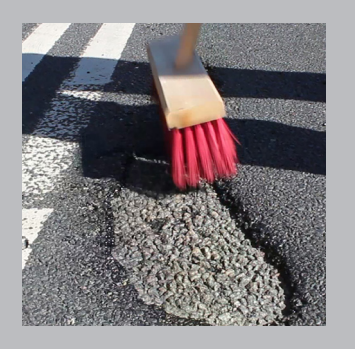
Remove debris and clean the repair area thoroughly.