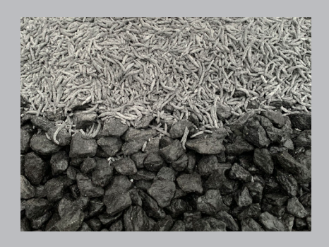
Apply in layers of ChipFill and AggreFil for optimal bonding.