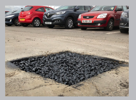
Rapid setting means that traffic can be re-opened within just 20 minutes.