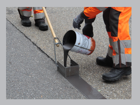
Use a screed box to apply the materia across the repair area.