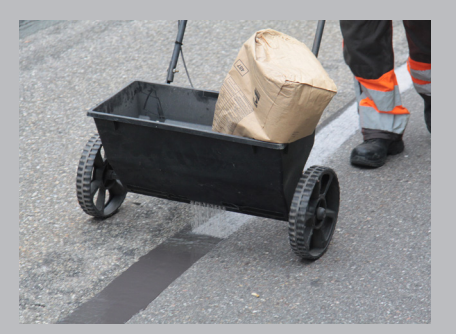
Add skid-resistance by applying glass grains over the still wet surface.