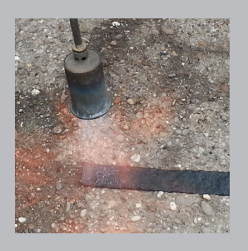
Bond BandFill to the crack by heating the material with a heat torch.