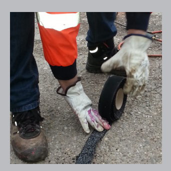
Roll BandFill onto the surface following the path of the crack