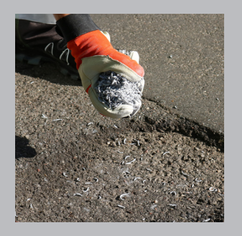
Apply an initial layer of maximum 15 mm.