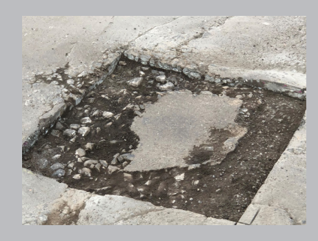
Easily repair damaged surfaces with a general depth of 25 – 60 mm.