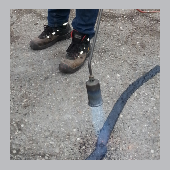
Sufficient heat has been applied when the material starts to bubble.