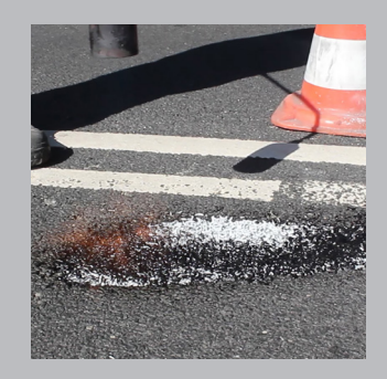
Heat material thoroughly and repeat process as necessary.