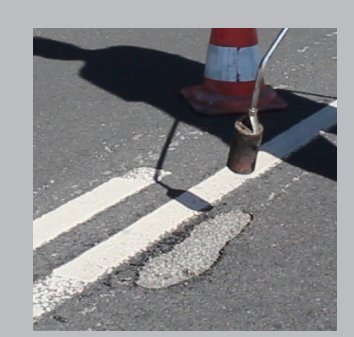
Remove moisture with a propane fueled heat torch.