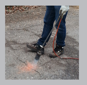
Brush away any dirt and remove moisture from the crack with a heat torch.